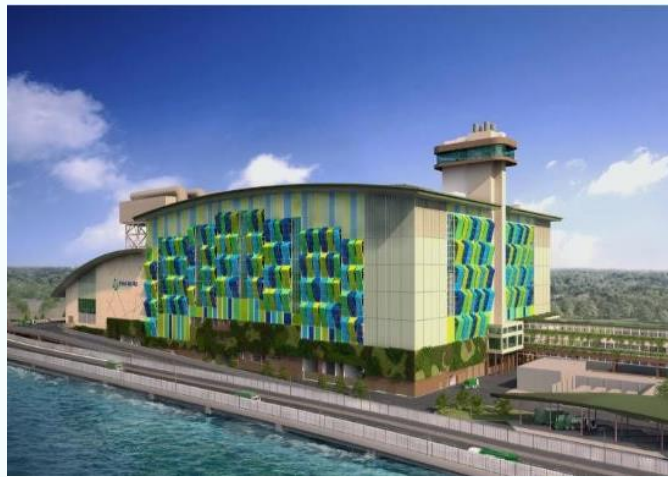
An artist's impression of the Tuas Nexus IWMF.

The National Environment Agency (NEA) has established a S$3 billion Multicurrency Medium Term Note (MTN) Programme and Green Bond Framework. The proceeds from the issuance of Notes under the MTN Programme will be used to finance sustainable infrastructure development projects. This includes the Tuas Nexus Integrated Waste Management Facility (IWMF), which will be Singapore's first integrated facility to treat incinerable waste, source-segregated food waste, and dewatered sludge from the Tuas Water Reclamation Plant. It will also sort recyclables collected under the National Recycling Programme.